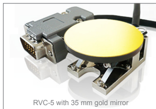
RVC-5 with 35 mm gold mirror

RVC-5. Small in size, big on possibilities, it's the first in a new line of compact rotational voice coil stages.