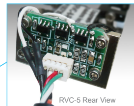
RVC-5 Rear View

Can easily be commanded to oscillate or move to any fixed point along its large angular range. Fully integrated, absolute angle position sensor electronics bolted to the rear of the unit has direct compatibility with the SCA814 Servo-Controlled Amplifier.